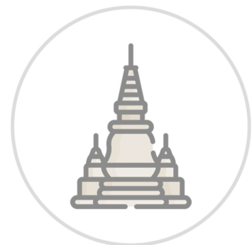
Places of Worship